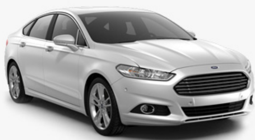
2013 Fusion Titanium shown